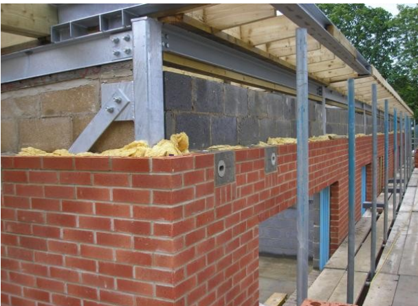
New Barnet, North London: Schwegler "Swift bricks installed in sheltered housing project

Don't stand and stare up at the nest box when the Swifts are around. It will put them off. After a while, if you ignore them, they will learn to ignore you. Don't disturb the Swifts at any time - they will desert the nest. Don't attempt to handle the birds unless you are a BTO Licensed Ringer. Don't allow creepers or plants to encroach on the nest. They will hinder the Swifts and give access to predators.